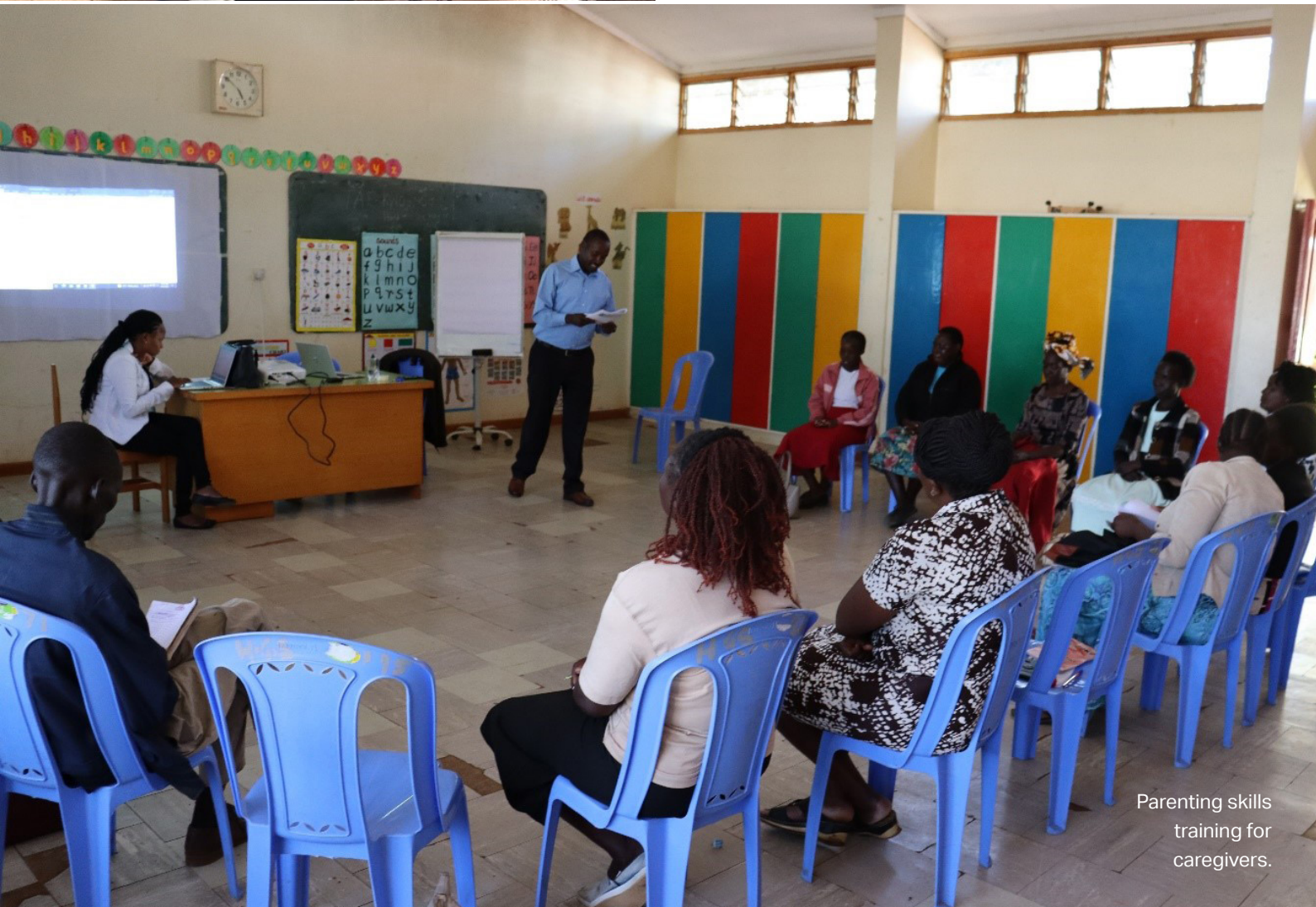
Parenting skills training for caregivers.