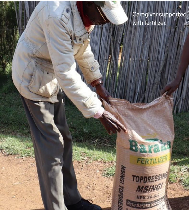
Caregiver supported with fertilizer.